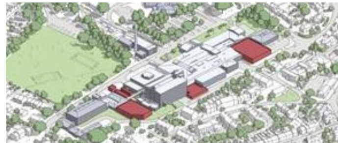
St Albans City Hospital