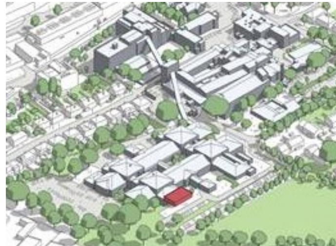
Hemel Hempstead Hospital