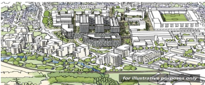
Watford General Hospital (for illustrative purposes only)